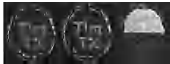
Fig. 3: 2X “Tim Tx” Excitation without (right) and with (center) B0 correction. 4X acceleration “half brain” excitation without B0 correction (left)

Successful implementation of 8-channel Parallel RF Excitation by body and head coil excitation for in vivo human study with B0 inhomogeneity correction has been realized. Both slice selective and 2D spatially selective excitation were created. For the slice selective excitation with no B0 correction (Fig. 2), large in-plane non-uniformity in the excitation profile is observed frontally. Significant improvement is achieved when B0 inhomogeneity is taken into account in the design. However, some residual non-uniformity can still be observed in